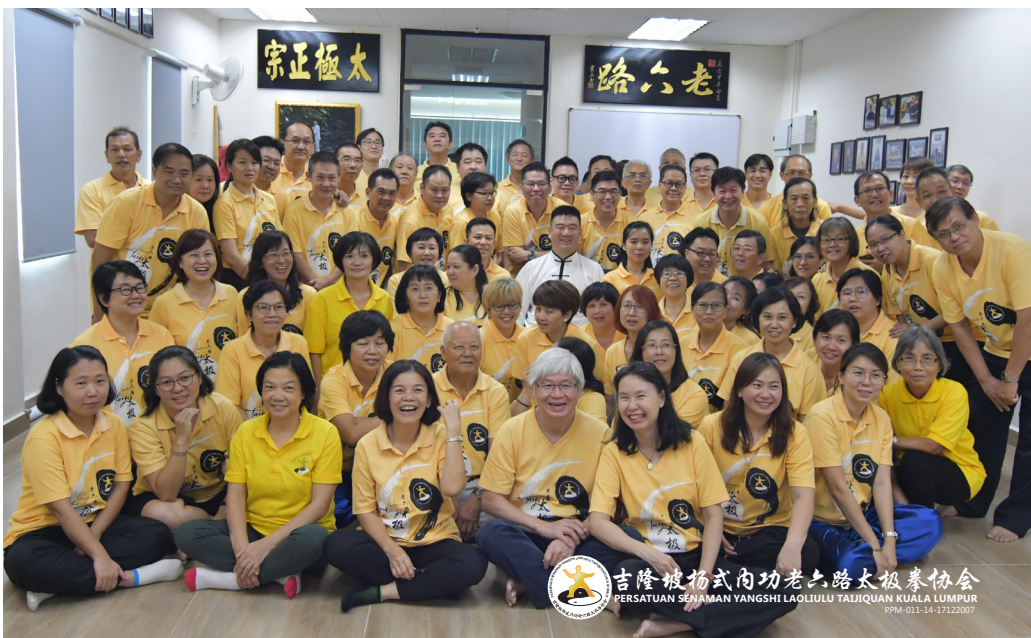
吉隆坡杨式内功老六路太极拳协会 PERSATUAN SENAMAN YANGSHI LAOLIULU TAIJIQUAN KUALA LUMPUR PPM-011-14-17122007

Spirit, mind and vitality are the core connotations and the context of reaching truth in Taoism culture, it is “the principle of unity, and the law of the expression”. For Taijiquan, these 3 elements are also key for the training of inner energy. To definite inner energy, we could say that it is a invisible force that conforms to the paths of natural activities of life and obeys the laws regulating natural physics. One’s inner energy is the introversive force accumulated by following these paths and laws.